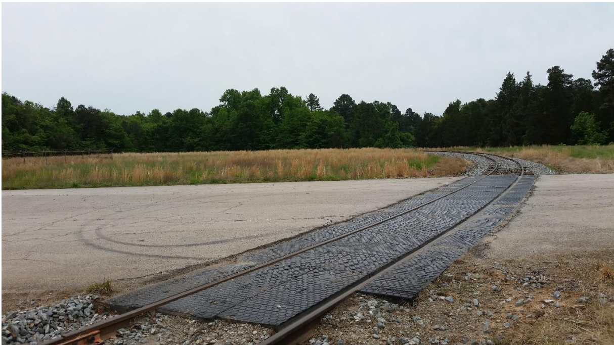
Rail Transload Site